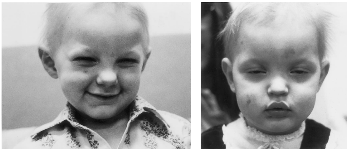
Figure 3 Two siblings, a 3.5-year-old male ( left ) and his 18-mo-old sister ( right ), from family ED 1014. Note their equal severity of involvement, including sparse scalp hair and periorbital pigmentation and wrinkling.

All families were informative for one or more markers that closely flank the EDA locus, and the results of the haplotypes are shown in figure 1. In four of the five